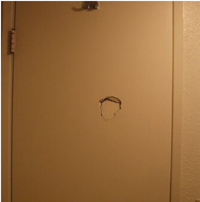
Hole punched in door