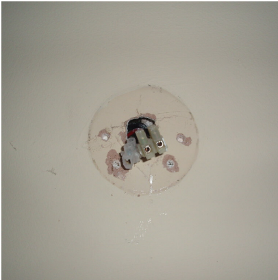
Fittings removed from ceilings/walls