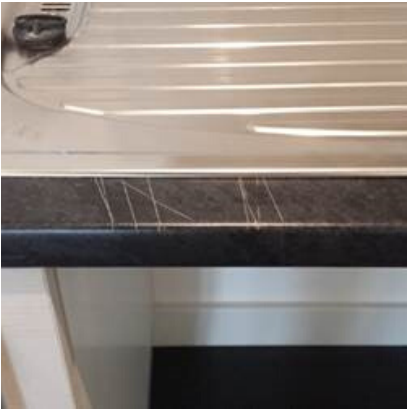
Unnecessary kitchen damage