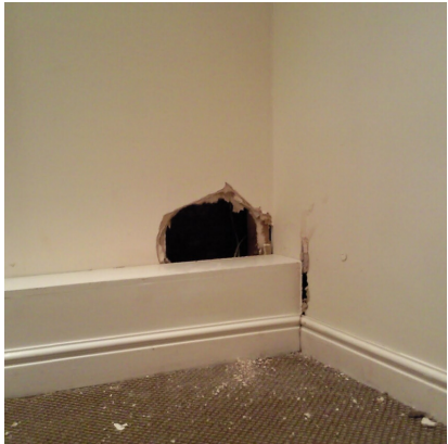
Hole kicked in the wall