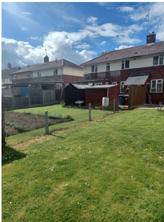
Dividing boundary Chain link fence

Dividing boundaries - we will put up a 3ft chain link with a 6ft privacy panel.