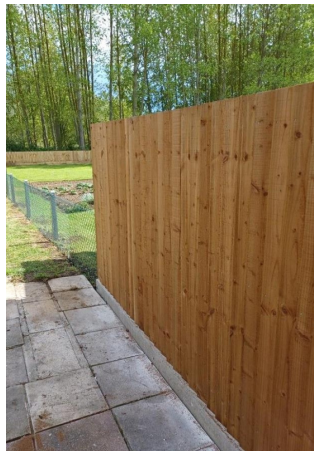
Dividing boundary Timber privacy panel